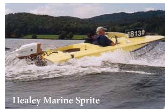
Healey Marine Sprite

1960 was a fabulous year for the Healey enthusiast. The smiling "Frog Eye Sprite" was in production for the automotive enthusiast. The boating enthusiast now had the "Healey Sprite" to provide that same enjoyable experience on the water. In fact, the advertising of the day showed the "Austin-Healey Sprite" pulling a trailer with the "Healey Marine Sprite". Donald Healey once said, "The combination of