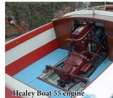
Healey Boat 55 engine

1957 saw an updated and up-rated "Sports Boat 55" brought out with a 1,600cc BMC B-series engine producing 80 hp and having twin carburetors. This engine was coupled to a US-made Warner