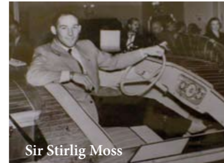
Sir Stirlig Moss

Boat designer, Geoffrey Lord, was working out of an old mill in Cornwall, working with Donald Healey, Lord designed the initial boat. It was a sharp chine design that was 16 feet in length with a 1500 CC BMC engine that had been "marineized". This boat is serial number 1001. This boat was displayed at the 1956 London boat show and purchased by a dealer from the Netherlands. It