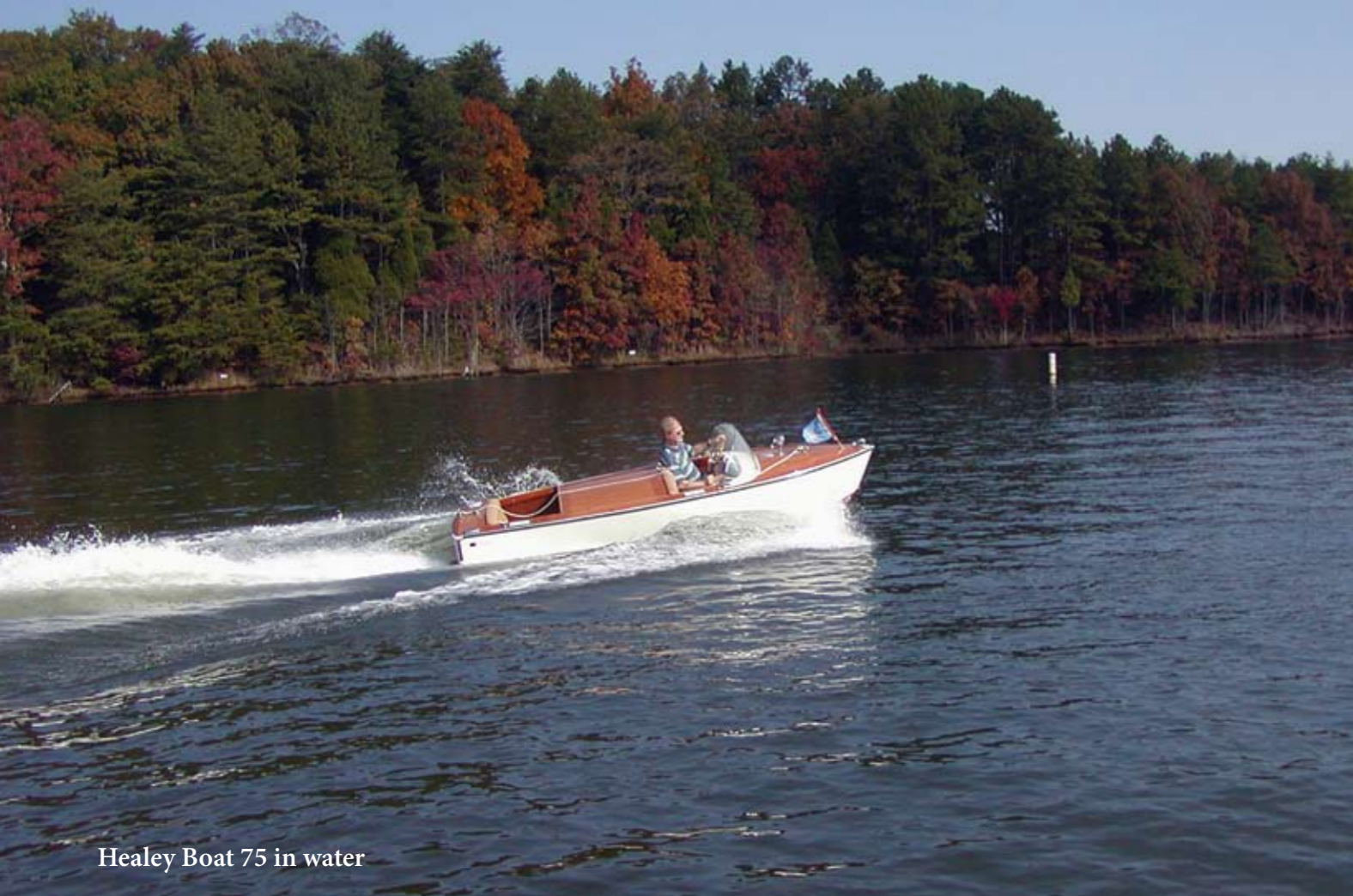
Healey Boat 75 in water

was also 14'6" long, powered by a variety