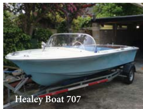
Healey Boat 707