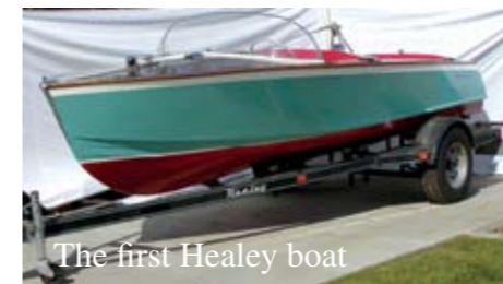
The first Healey boat

currently resides in the USA where it has won the prestigious "Wooden Boat" Concours. A limited number of similar, but slightly smaller (14 feet 6 inches) [or 4.42 meter] boats, the "Sports Boat 55" were produced in Bridport, Dorset.